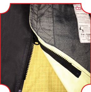
Fully Detachable Liner