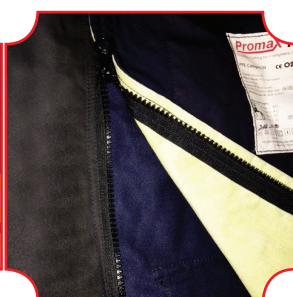
Fully Detachable Liner