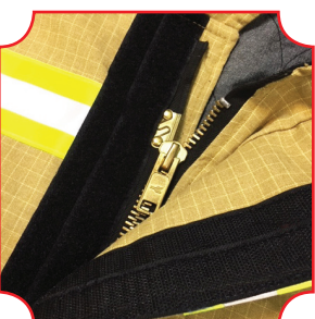
Quick Release Zipper