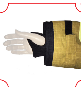
Full Wrists Cover Cuff