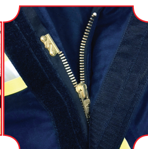
Quick Release Zipper