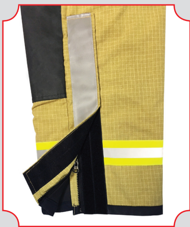
Trousers Side View