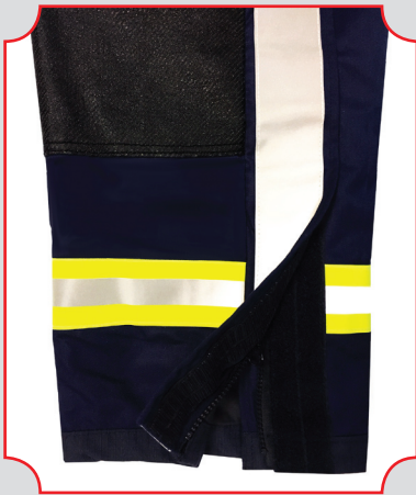
Trousers Side View