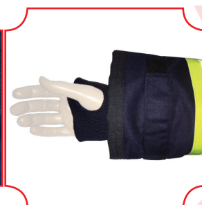
Full Wrists Cover Cuff