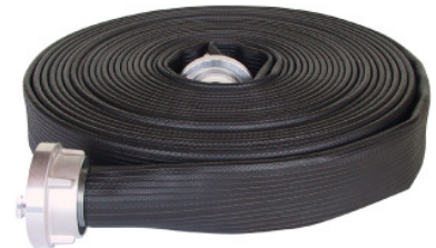
PROFI in black